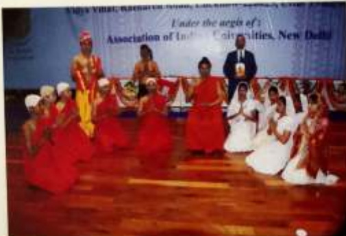
'बुद्धं सरणं गच्छामि' का मंचन करते कलाकार