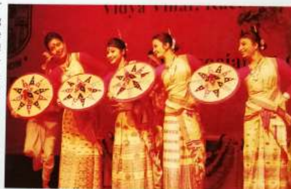
The Guwahati University's students performing 'Bihu' folk Dance